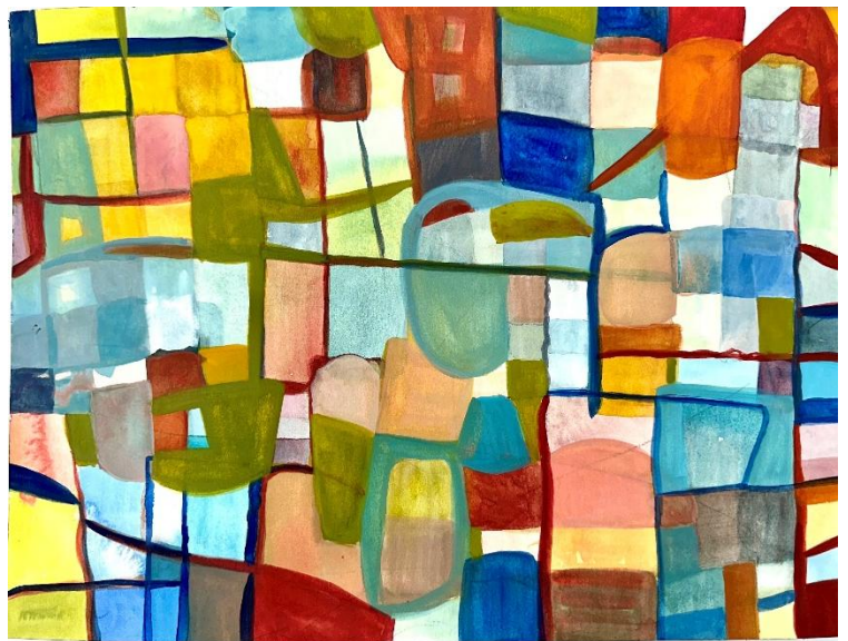
Ten Blocks © 2025 Erica H. Adams, Watercolor and Carbon on Hahnemüle Paper; 11.8 x 15.7 inches.

Erica H. Adams' painting Ten Blocks will be included in the upcoming juried exhibition "Resist Restrictions" at Moakley U.S. Courthouse in Boston. The exhibition features artists from the Massachusetts chapter of the National Association of Women Artists and runs from June 30 through September 29 , 8:30 a.m. to 5:00 p.m. weekdays. Congratulations, Erica!